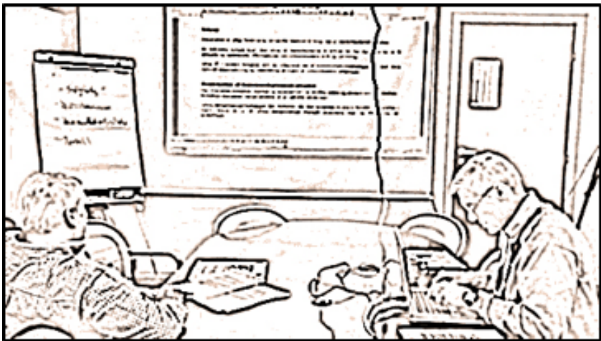
Figure 1 - The meeting setting