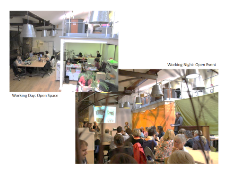
Figure 1: Open space by day, conference hall by night

The business activity of a coworking space is twofold (Figure 1). Its primary activity is to operate the workplace for residents. Its secondary activity is to organize events with a variety of formats and themes, either restricted to members or open to a broader public.