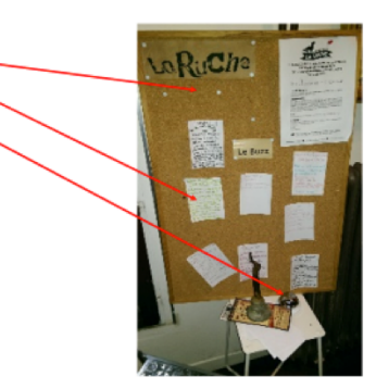
Figure 5: Three artifacts of The Buzz