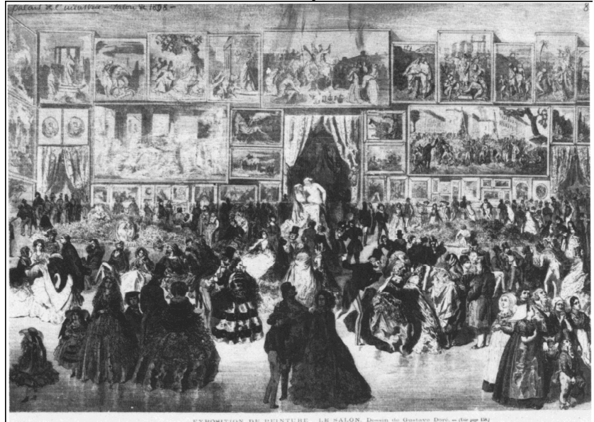
Illustration 1. The Salon of 1868 by Gustave Doré