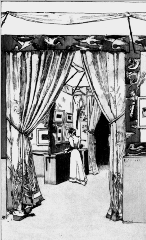
Illustration 2. “The Durand-Ruel Gallery, Rue Laffitte in 1893”. Anonymous engraving