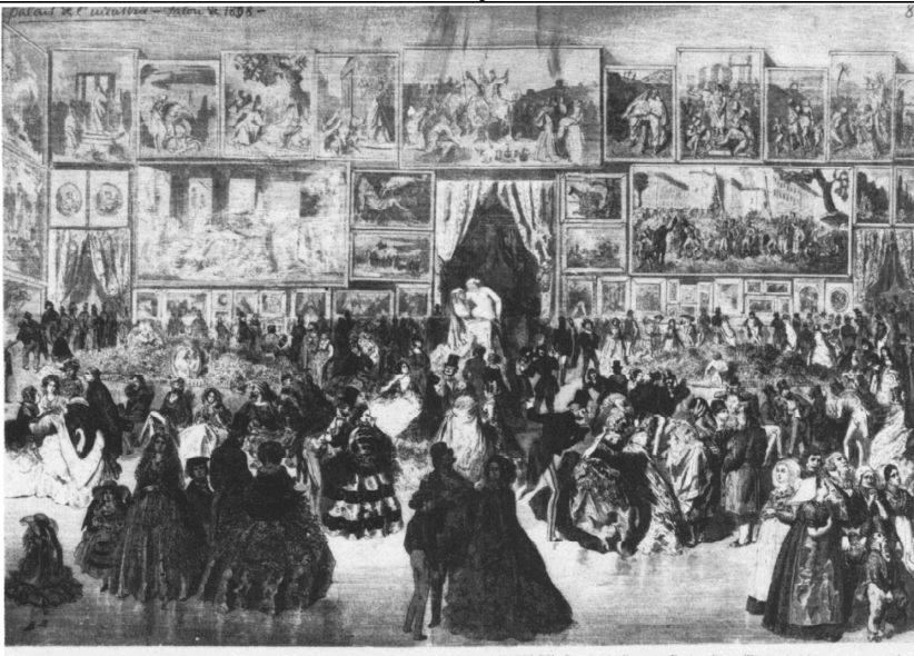
Illustration 1. The Salon of 1868 by Gustave Doré